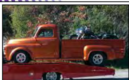
1953 Dodge Truck