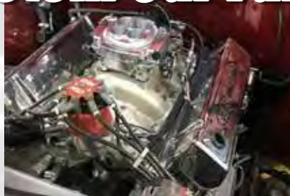
Fuel Injection Installs