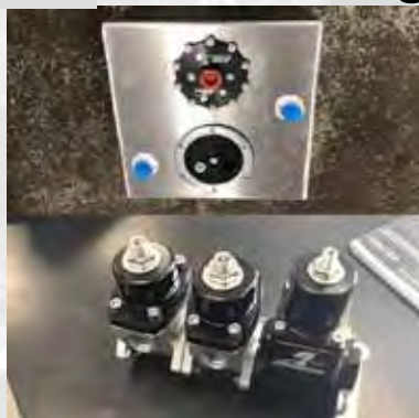
Fuel System Upgrades