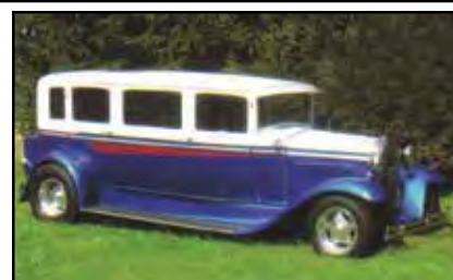
1930 Ford Limousine

We have built many National Show Winners!