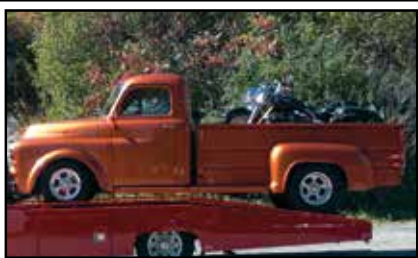
1953 Dodge Truck