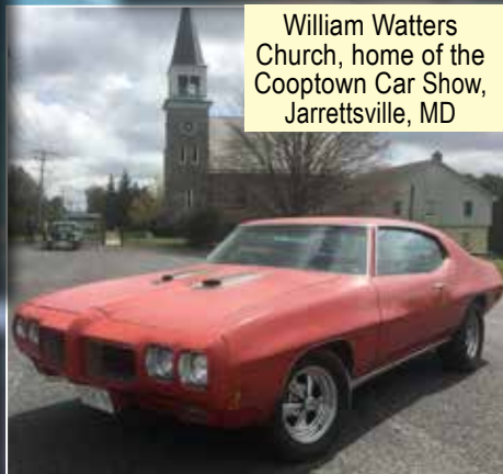
William Watters Church, home of the Cooptown Car Show, Jarrettsville, MD