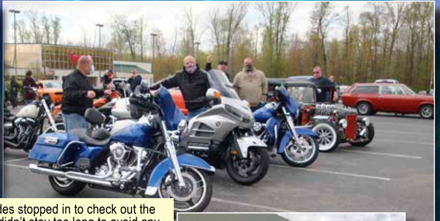
Biker dudes stopped in to check out the cars. We didn't stay too long to avoid any hassles with the local law.