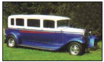
1930 Ford Limousine

We have built many National Show Winners!