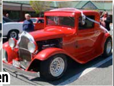
White Marsh to Loch Raven