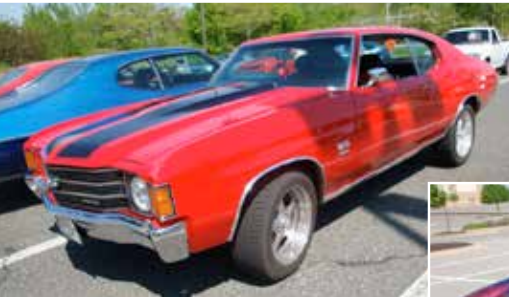
The view from Drew and Anita Hill's '66 LeMans.

Club 56 put on a properly "socially distanced" cruise through the countryside. I don't think the cars were ever less than six feet apart, and many had those "Do Not Touch" signs. Just Kidding!! Our drive included a run through the covered bridge at Jerusalem Village in Kingsville, and ended at the Boulevard.