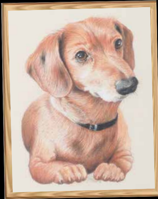
11" X 14" - $ 149