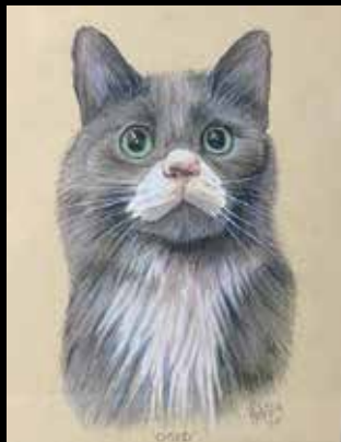
8" X 10" - $ 99