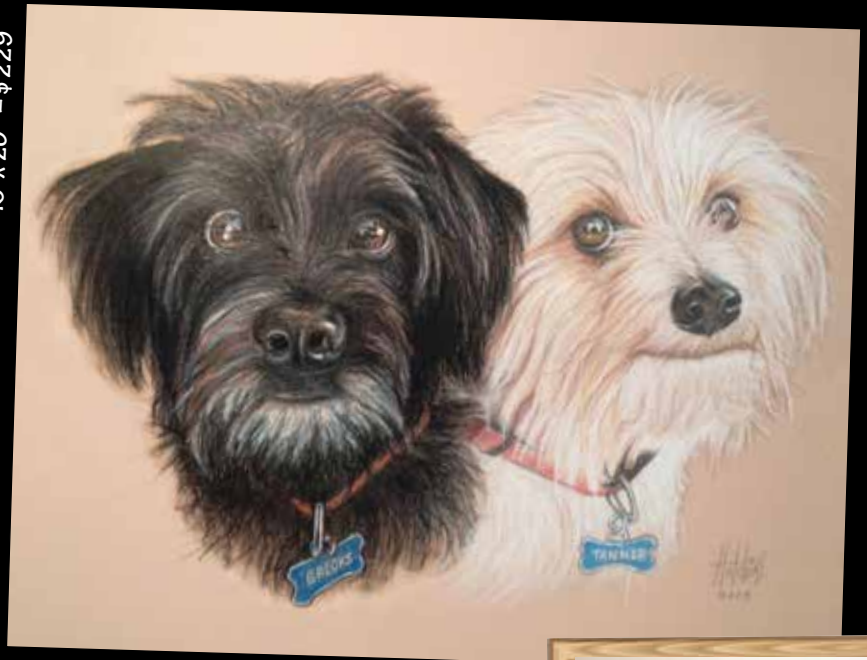
16" X 20" - $ 229